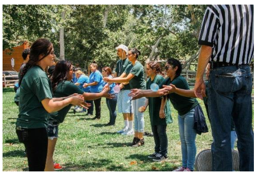
Company Picnic Specialists • 638 Camino De Los Mares Suite H130-470 • San Clemente, CA. 92673