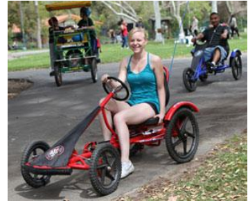
Quad Sport $15.00 per Hour