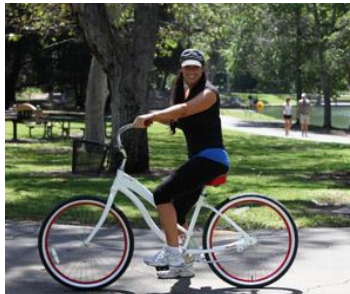
Women's Cruiser $15.00 per Hour