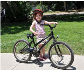
Kids' Bike $10.00 per Hour