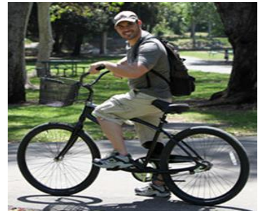
Men's Cruiser $15.00 per Hour