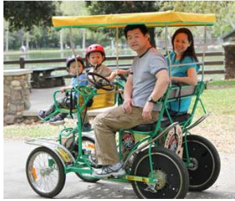
Single Surrey Bike $30.00 per Hour