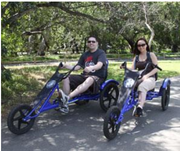
Chopper $15.00 per Hour