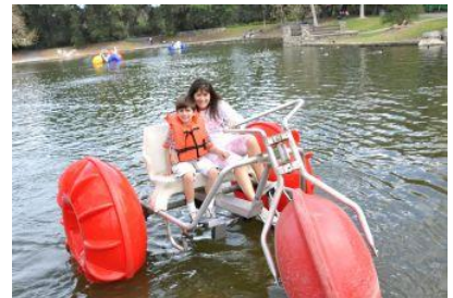
Paddle Boats $20.00 per ½ Hour

Company Picnic Specialists • 8502 East Chapman Avenue, #434 • Orange, CA 92869 Phone: (714)997-3656 • Fax: (714)997-3035 www.CompanyPicnicSpecialists.com