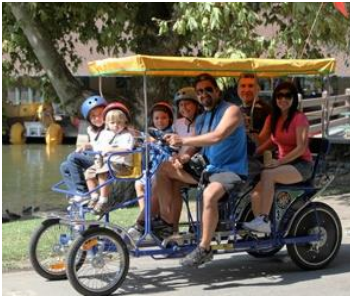
Double Surrey Bike $40.00 per Hour

Your group can purchase “rental” coupons to use throughout the day when booking a catered picnic by Company Picnic Specialists. Please note this is only available to events held inside Irvine Regional Park.