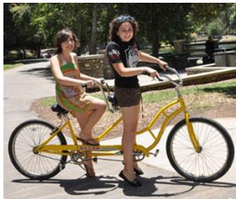
Tandem Bike $20.00 per Hour