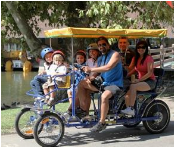
Double Surrey Bike $40.00 per Hour

Your group can purchase “rental” coupons to use throughout the day when booking a catered picnic by Company Picnic Specialists. Please note this is only available to events held inside Irvine Regional Park.