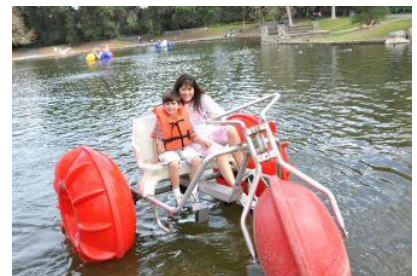
Paddle Boats $20.00 per 1/2 Hour

Company Picnic Specialists • 8502 East Chapman Avenue, #434 • Orange, CA 92869 Phone: (714)997-3656 • Fax: (714)997-3035 www.CompanyPicnicSpecialists.com